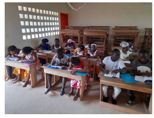
Fig 2 Photographs from skills workshops (numeracy and literacy training) – images from sessions delivered in the village of Roc.