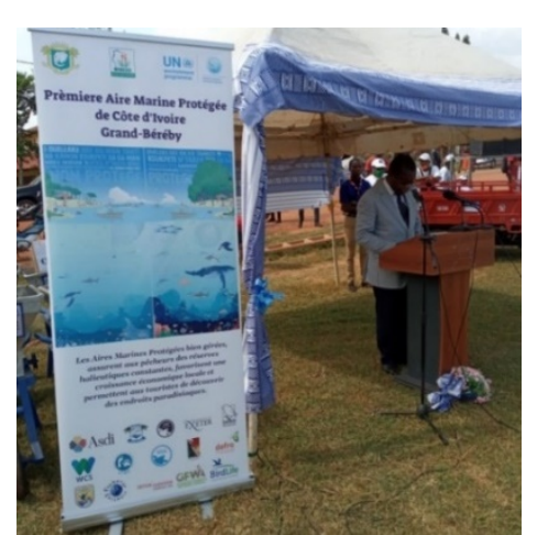
Fig 8 Minister for the Environment and Sustainable Development, Professor Joseph Séka Séka giving the opening speech at the ceremony for the creation of Côte d'Ivoire's first marine protected area in Grand-Béréby (21st December 2020). Banner image is environmental education campaign material created as part of the Darwin Initiative project (see Fig 5), with Darwin logo included in the footer.