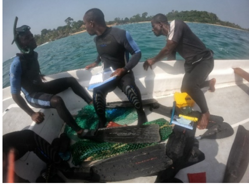
Fig 3 Darwin marine research team launching CEMs research pirogue and heading out to conduct a research survey.

A standardized line-transect survey design was developed to sub-sample 46.7 km² of the study area, from Grand-Béréby to Taki, and from the littoral zone out to the 20 m depth contour (Annex 4 Fig S2.1). A total of 8 transects across 8 zones were surveyed, with the team sampling 40 locations (collecting data on water temperature, salinity, depth, habitat type, and observed species) along 27km of transects across the study area (Annex 4 Fig S2.2). The findings documented a diversity of demersal habitats and species (Annex 4 Fig S2.3) and have been combined with those of the previous surveys conducted in 2018 and 2020, and summarised in a detailed report ( Activity 2.3 ) with spatial data incorporated into the most recent version of the marine atlas ( Activity 2.4 ), both of which have been appended as evidence with our submission (Annex 4 Fig S2.4).