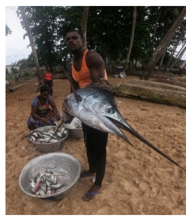
Fig 4 First record of the smoothback angelshark ( Squatina oculata ) in Côte d'Ivoire (left), the 3-man MIPARH team (standing) who are responsible for undertaking landing site surveys (middle), and fish processor and Atlantic sailfish ( Istiophorus albicans ) landed in Dawa (right).

Key findings: Since the project provided MIPARH with several species identification guides, we have seen a 32% increase in the number of fish and shellfish species documented (photographed and validated) in fisheries landing surveys in FY2 (n = 45) compared to FY1 (n = 34) and a better understanding of how species are being grouped and classified in the MIPARH records. Similar trends were evident regarding efforts to photograph fisheries catches at landing sites, which has resulted in a 126% increase in the number of species recorded in FY2 (n = 93) compared to FY1 (n = 41). These data have been shared with international scientific experts, and supported the creation of species landings photographic record guide (Annex 4), which highlighted a much greater diversity in catch than was initially apparent and revealed several species of conservation concern (e.g. shortfin mako shark, Isurus oxyrinchus ; blackchin