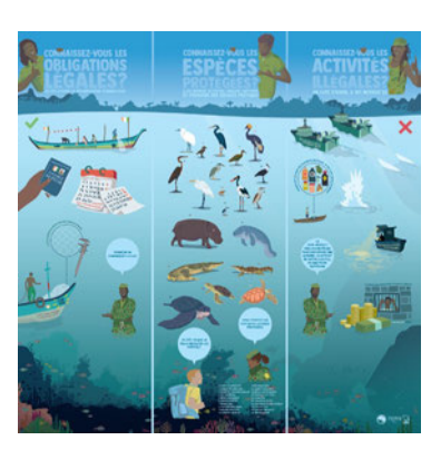
Fig 5 Environmental education campaign material (2 m x 2 m) – from left to right differences between protected and unprotected areas, ecosystem service benefits of nature, and fisheries rules and regulations (see www.ong-cem.org/our-actions for higher resolution files).

Whilst the environmental education seminars for local villagers ( Activity 4.3 ) were initially delayed in FY1 due to national restrictions associated with COVID-19 (see Annual Report 1), these were delivered to individuals from 9 coastal communities (at 7 locations) between 10th June and 18th June 2020 – reaching a total audience of 612 individuals (average attendance per community: 102, range 34 – 155 persons), with 39% of attendees being female (Adults: 228 male, 155 female; Children: 144 male, 85 female).